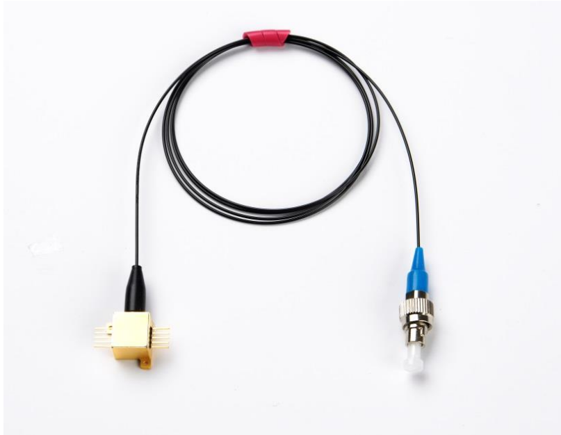
(NFAD with TEC Mini-Flat Type)

(Pigtailed 10 pin Mini-Flat type Negative Feedback Avalanche Diode)