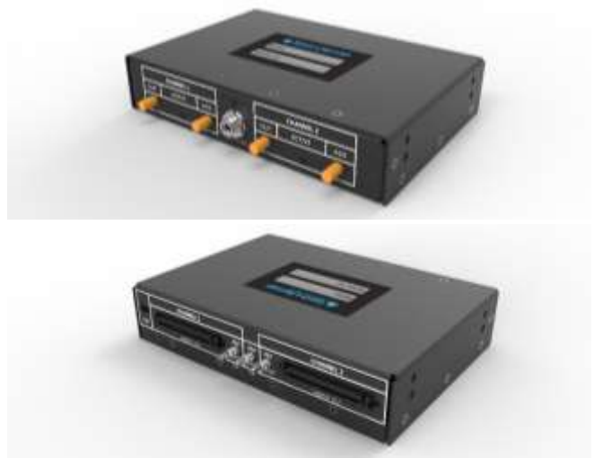
Front and rear view

The Dual Driver is available in two frequency bands, and each unit includes a monitor output that covers the entire 20-450 MHz frequency band. Driver functionality can be re-configured over the USB interface; for further details please contact us.